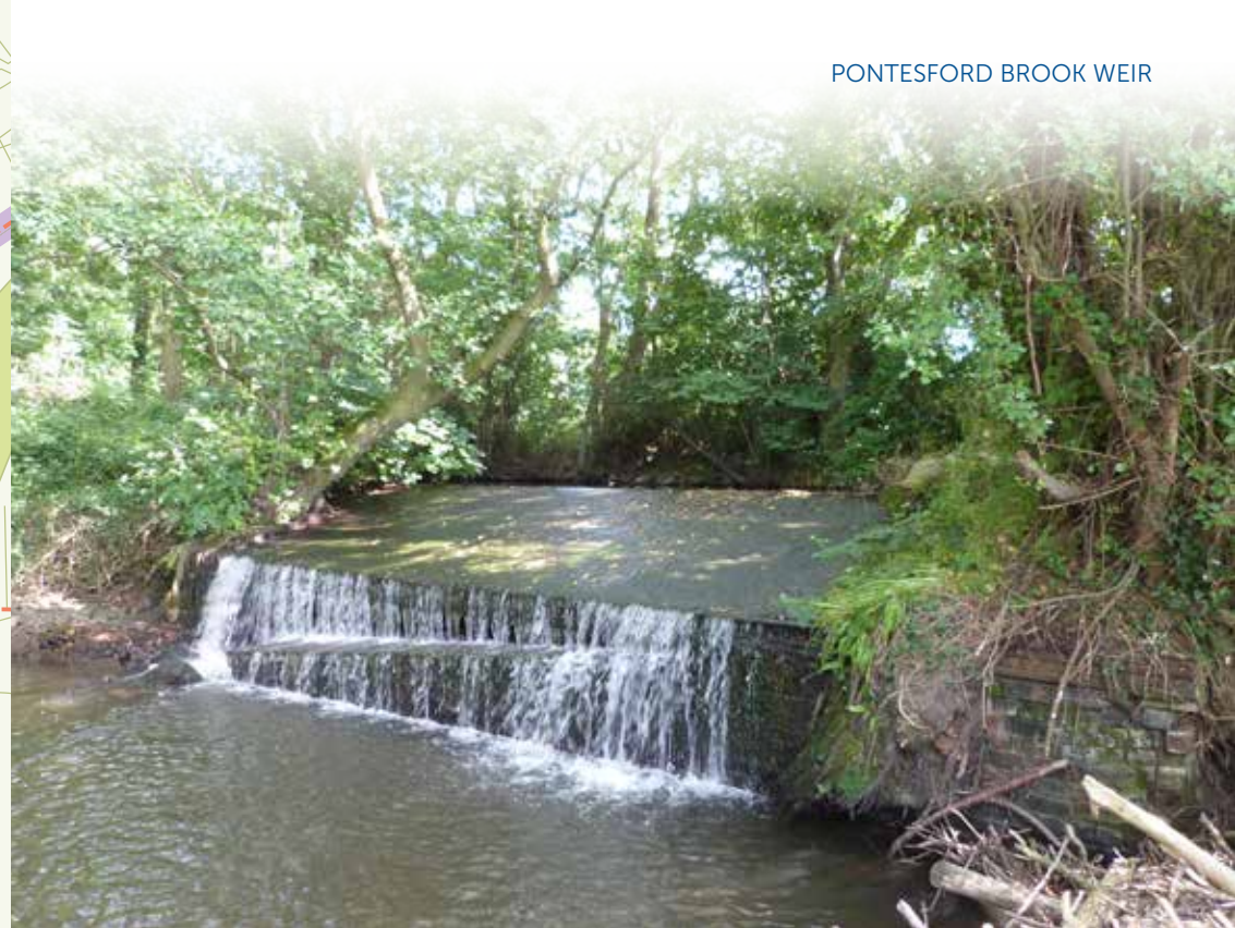
PONTESFORD BROOK WEIR