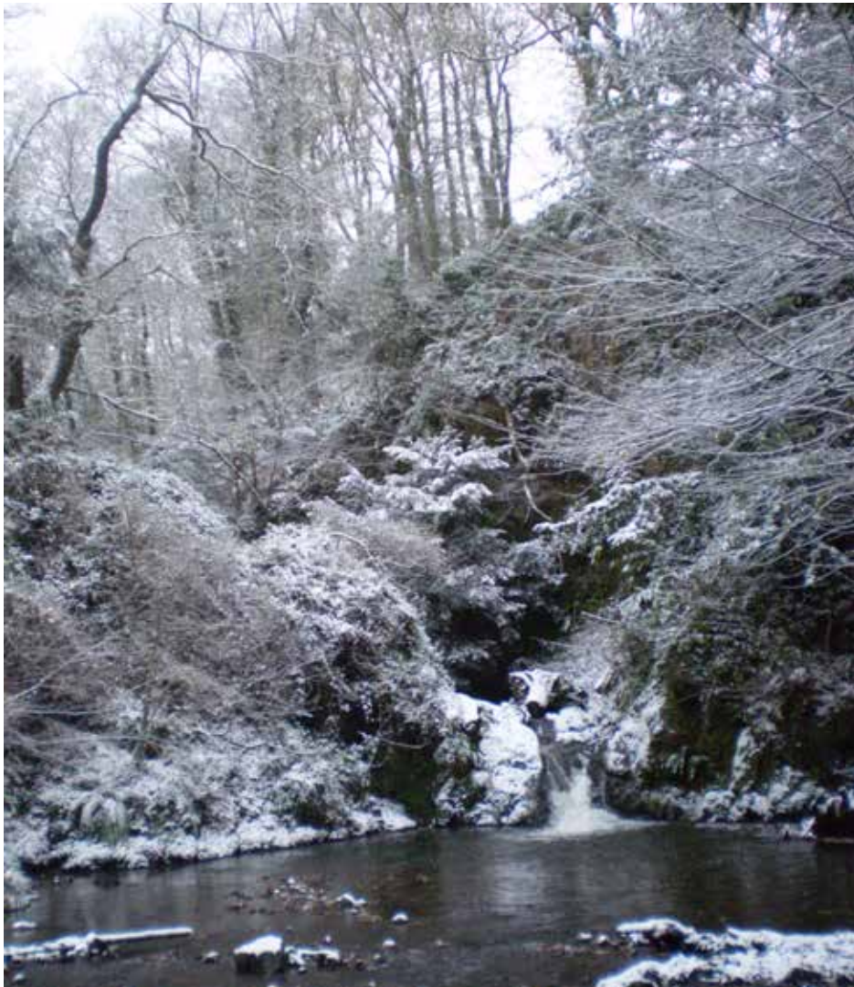
LYDD HOLE IN WINTER