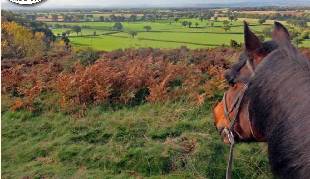
View from The Cliffe to Hopton and Welsh Hills

Shrubbs Common on Hopton Hill is reputed to be the smallest Common in the England. Once mostly grassland with grazing rights, the Jones family built a squatters cottage in the middle in the early 1900s, and lived there for 19 years. Some of the bluebells and flowers are escapees from their garden. We pass through and up onto The Cliffe Common and its sandy bridleways. Watch out for the flash of the green woodpecker and colourful jay. The ridge route gives panoramic views all over Shropshire, to the Welsh mountains, and north to the Cheshire Plains. A plaque marks the site of the WWII Home Guard look out post. This is a lowland heath with heather and whinberries. Beside our route, at the north end of the Common, are the remains of the turf sided Cliffe Cabin, built by squatters.