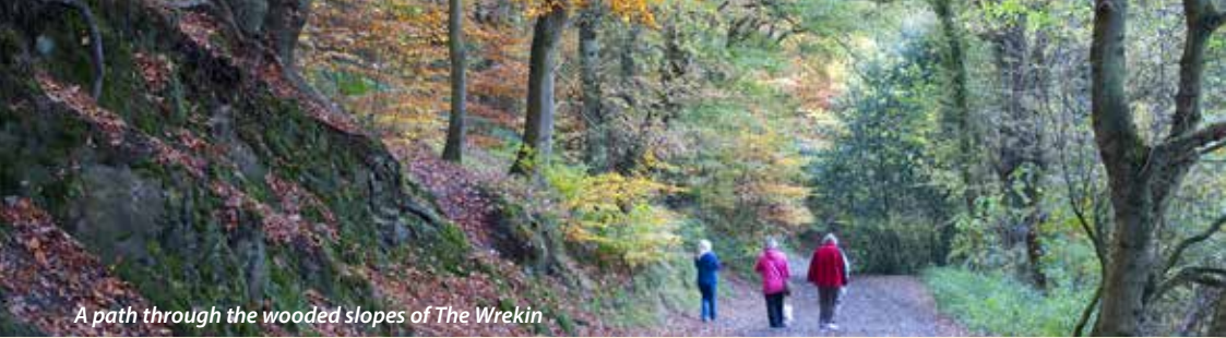
A path through the wooded slopes of The Wrekin