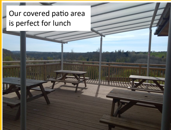
Our covered patio area is perfect for lunch