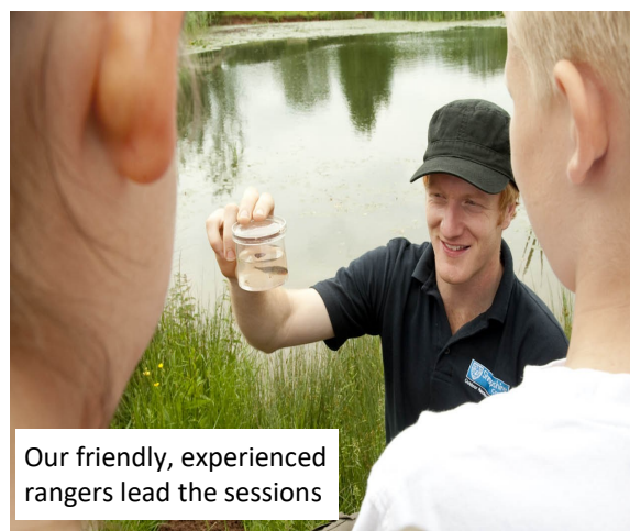
Our friendly, experienced rangers lead the sessions

The park is now an area for outdoor recreation as well as a haven for wildlife. We have a large visitor centre with a welcome area which tells our story. We have an indoor classroom and a covered patio area which is perfect for lunch time.