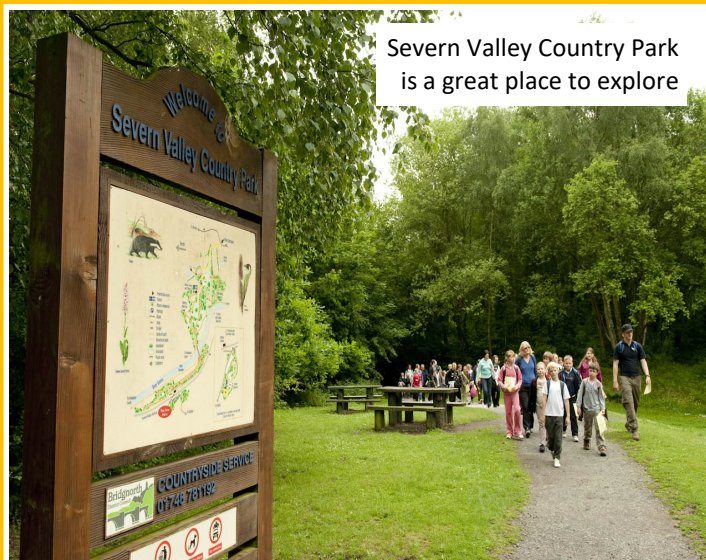
Severn Valley Country Park is a great place to explore

At Severn Valley Country Park, we provide a wide range of outdoor educational activities for kids. Our activities are fun and entertaining and all link to the curriculum.