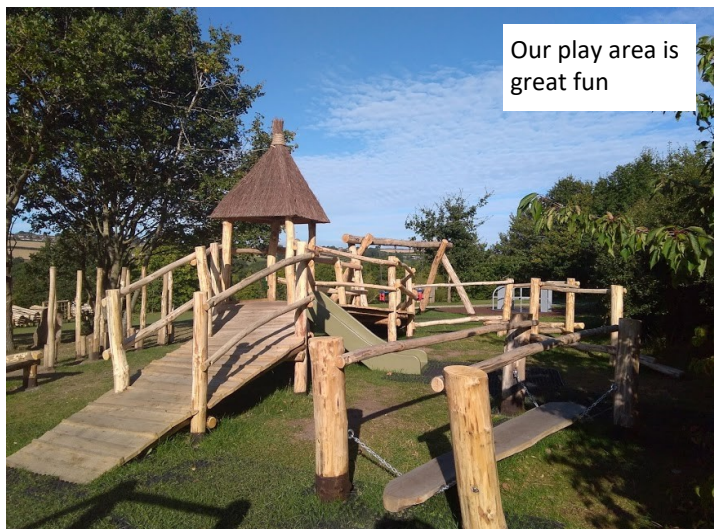
Our play area is great fun